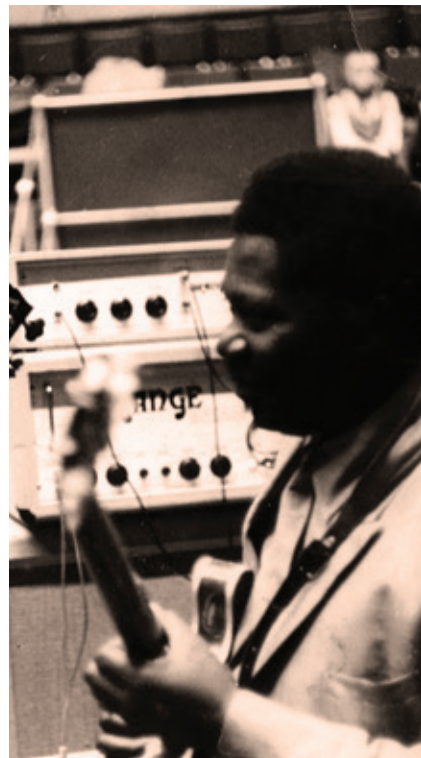
B.B. King - 1969