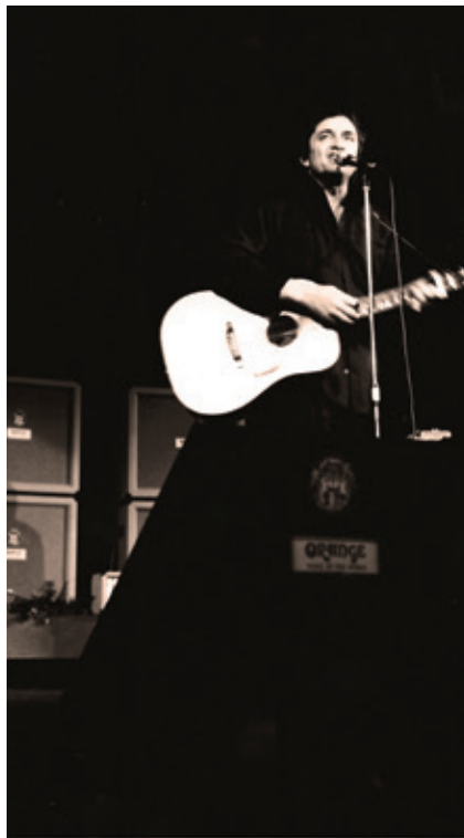
Johnny Cash - 1972