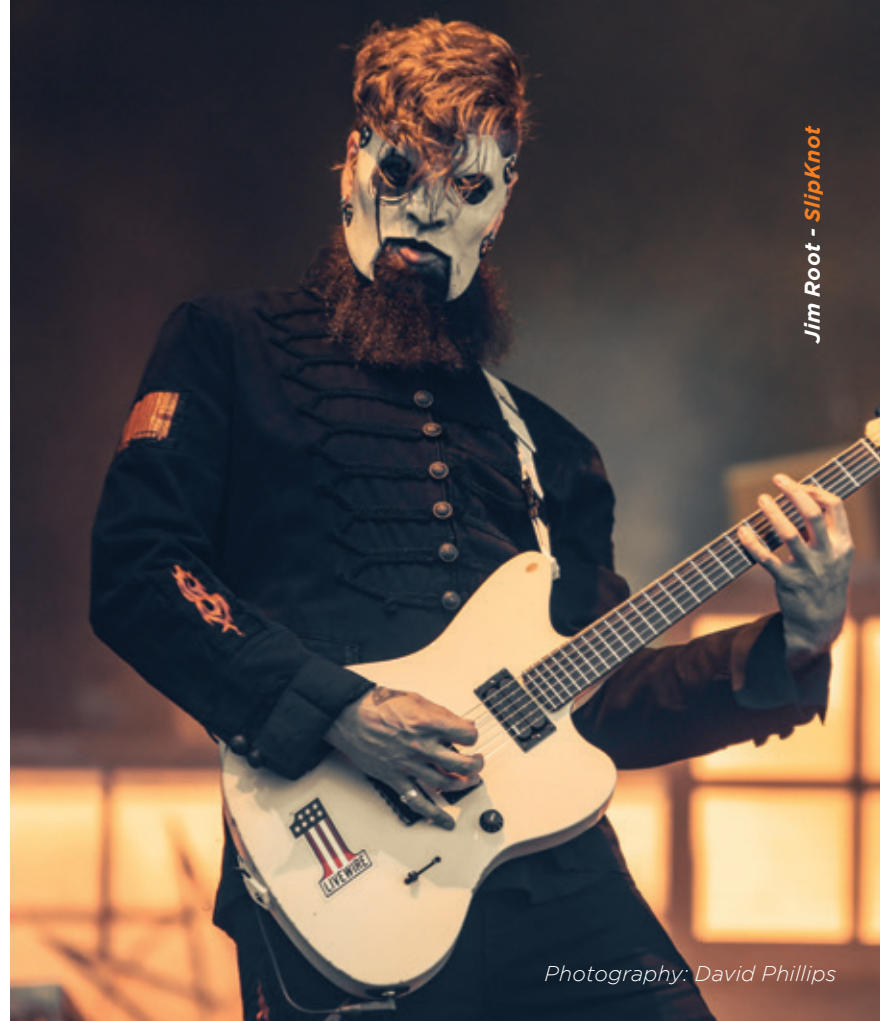
Jim Root - Slipknot