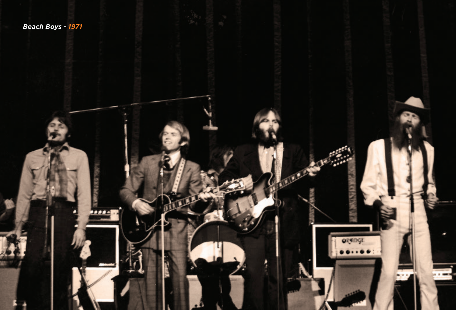
Beach Boys - 1971