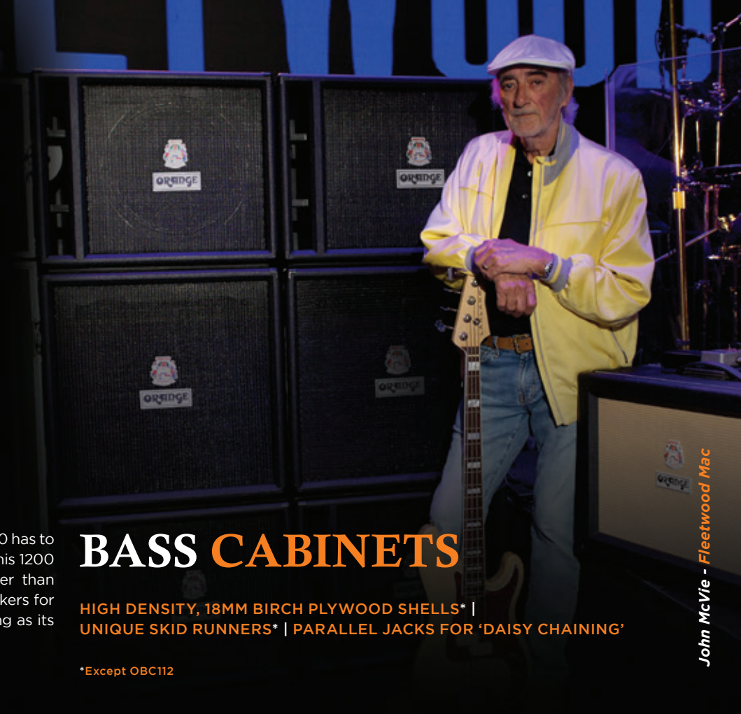
John McVie - Fleetwood Mac