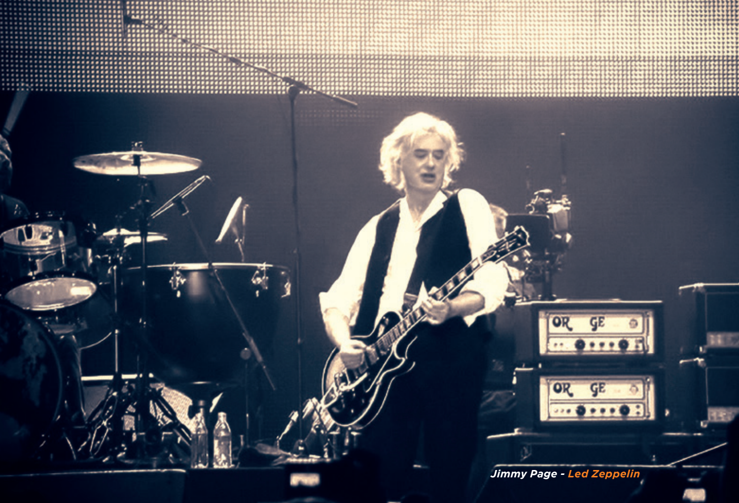
Jimmy Page - Led Zeppelin