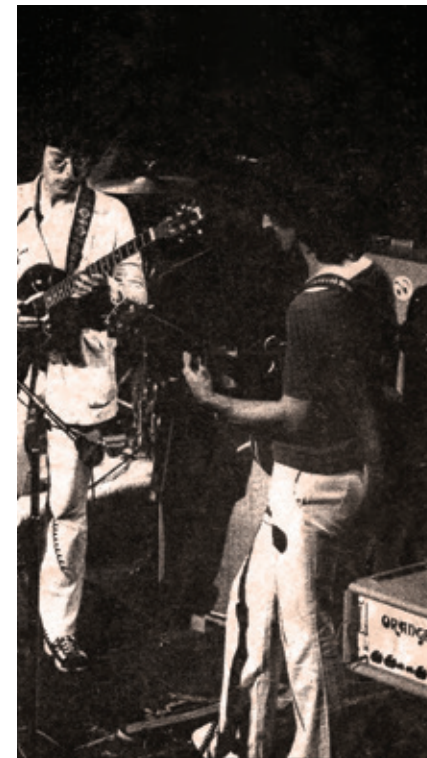
John Lennon & Frank Zappa - 1972