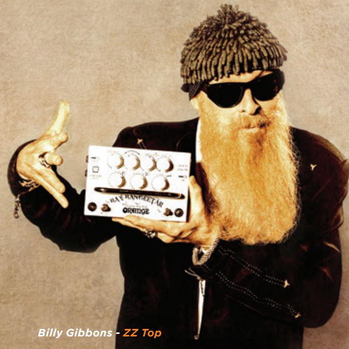
Billy Gibbons - ZZ Top

This is one of those rare pedals you'll really miss when it's bypassed. Whichever way the controls are set, the Kongpressor's Class A circuitry adds a satisfying character to the sound - transparent but somehow fatter. The result is a more punchy and full-bodied tone with great feel under the fingers.