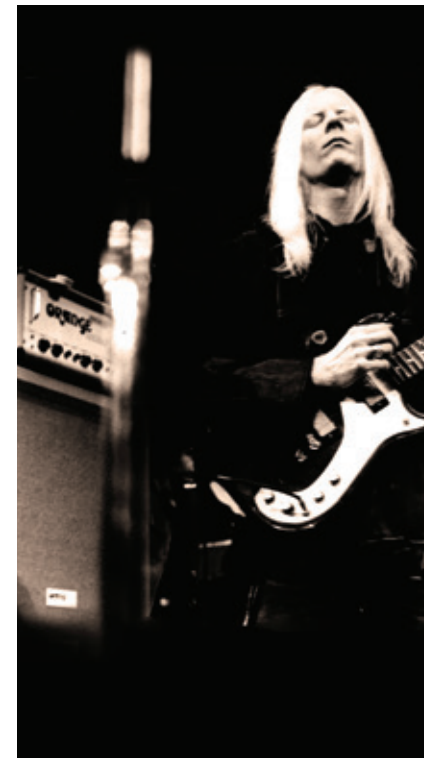
Johnny Winter - 1970