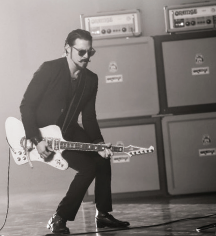
Scott Holiday - Rival Sons