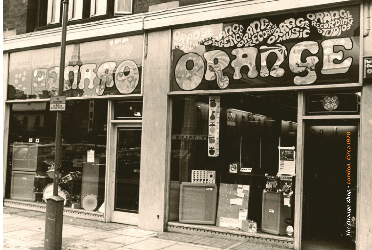
The Orange Shop - London, Circa 1970

Today, with a team of the industry's finest engineers, we remain true to our founding values, committed to pushing back the boundaries of conventional design. From our very humble beginnings on New Compton Street, Orange Amplification has grown into an iconic global brand, earning legions of loyal supporters along the way who continue to make the 'Voice of the World' heard.