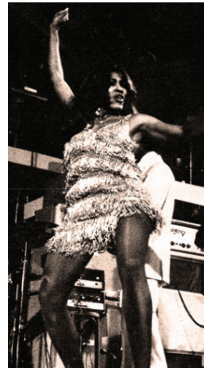
Tina Turner - 1972