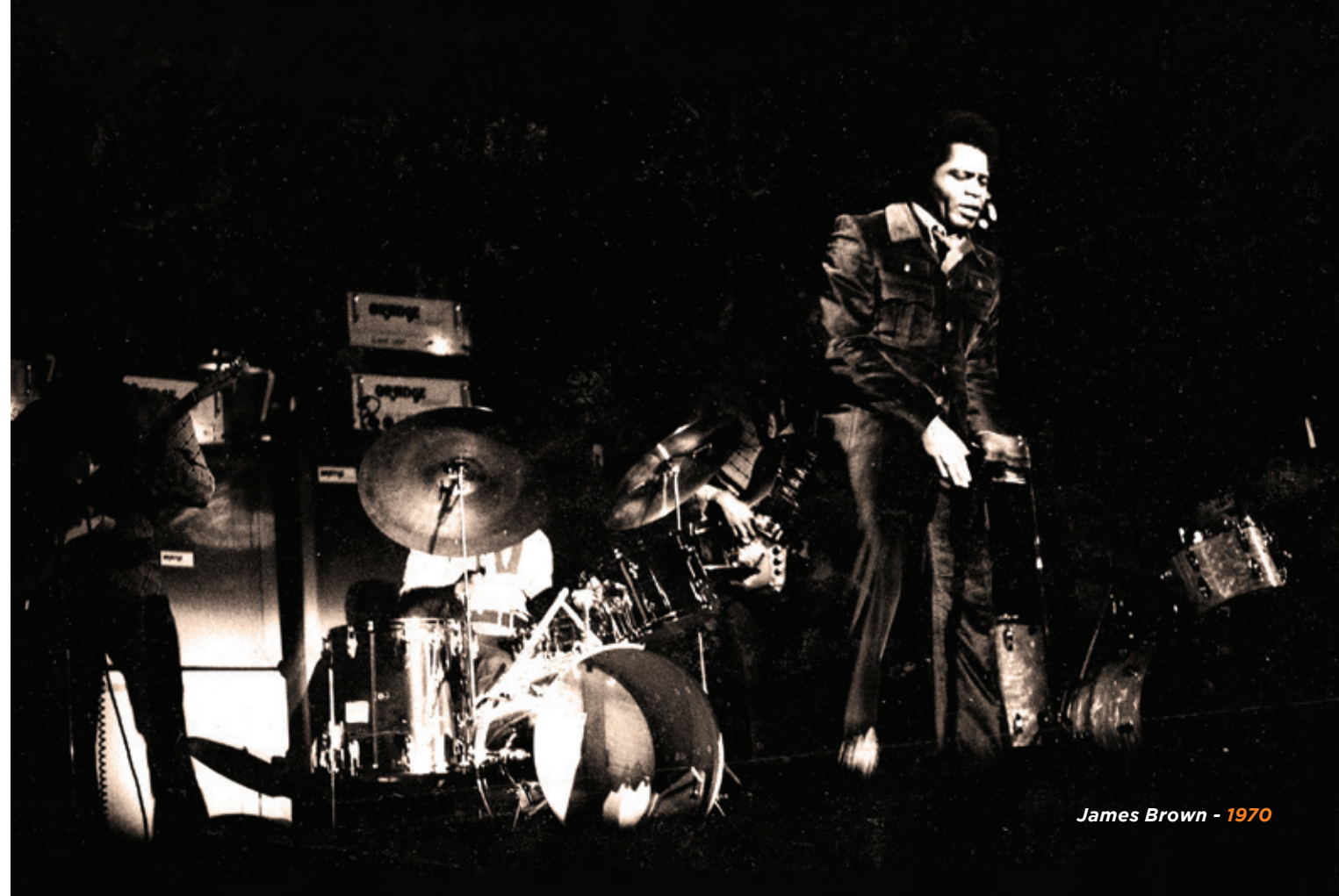
James Brown - 1970