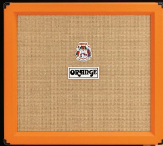
Stephen Carpenter - Deftones

The commanding PPC412 is our full-sized 'straight front' 4x12" cabinet and is equipped with four Celestion Vintage 30 speakers. The immense power, low end focus and vocal midrange has made the PPC412 a mainstay of touring artists all over the World.