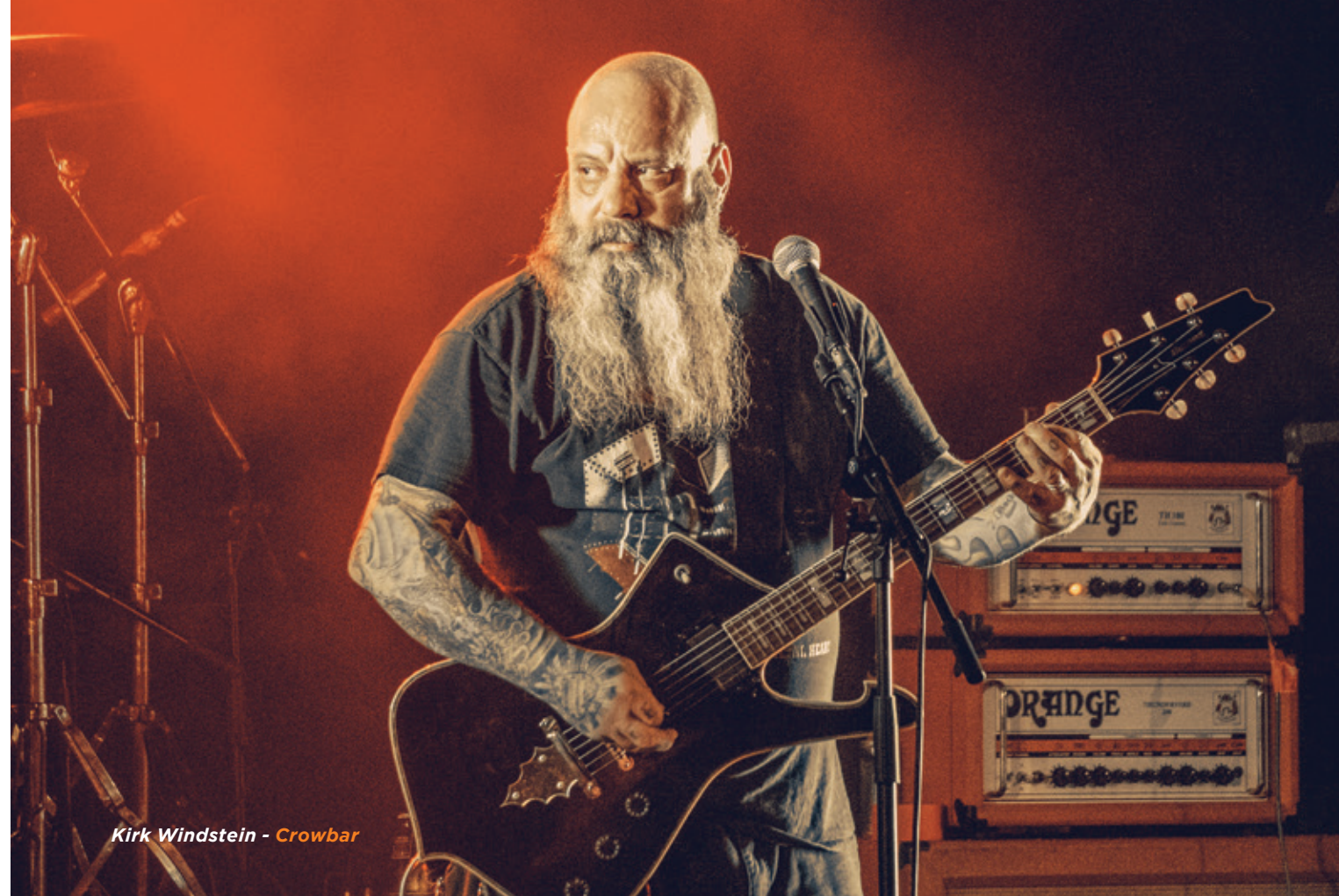
Kirk Windstein - Crowbar

However you set it, the TH30 amp remains unerringly focussed, steeped in complex harmonic overtones even at maximum gain settings.