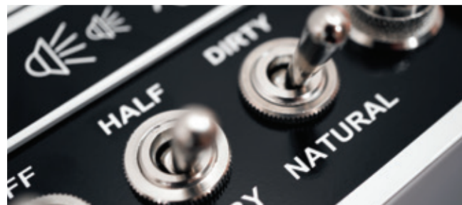
Natural & Dirty channel - Headroom Bedroom Switch

The Rocker 15 Terror switches between 15, 7, 1, 0.5 Watt. When in Bedroom mode, the circuit has been designed to retain the springiness and feel that we love about valve amps. The result is this Terror sounds and feels more like a big amp. This makes for great tones in the practise room or the studio, with the option of full power for the stage.