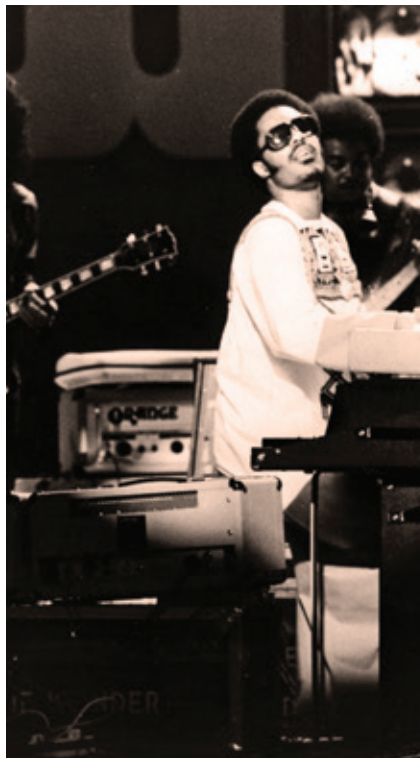
Stevie Wonder - 1973