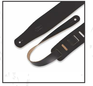
Also available in: